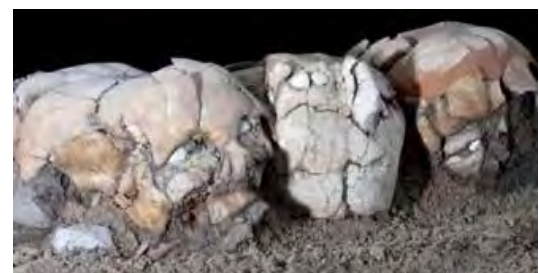
Hyperostosis frontalis interna (HFI) identified via CT and direct observation (skeletal).