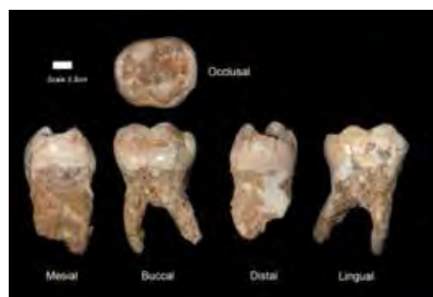
Teeth from Qesem cave 300,000 years. Modern human origin project.